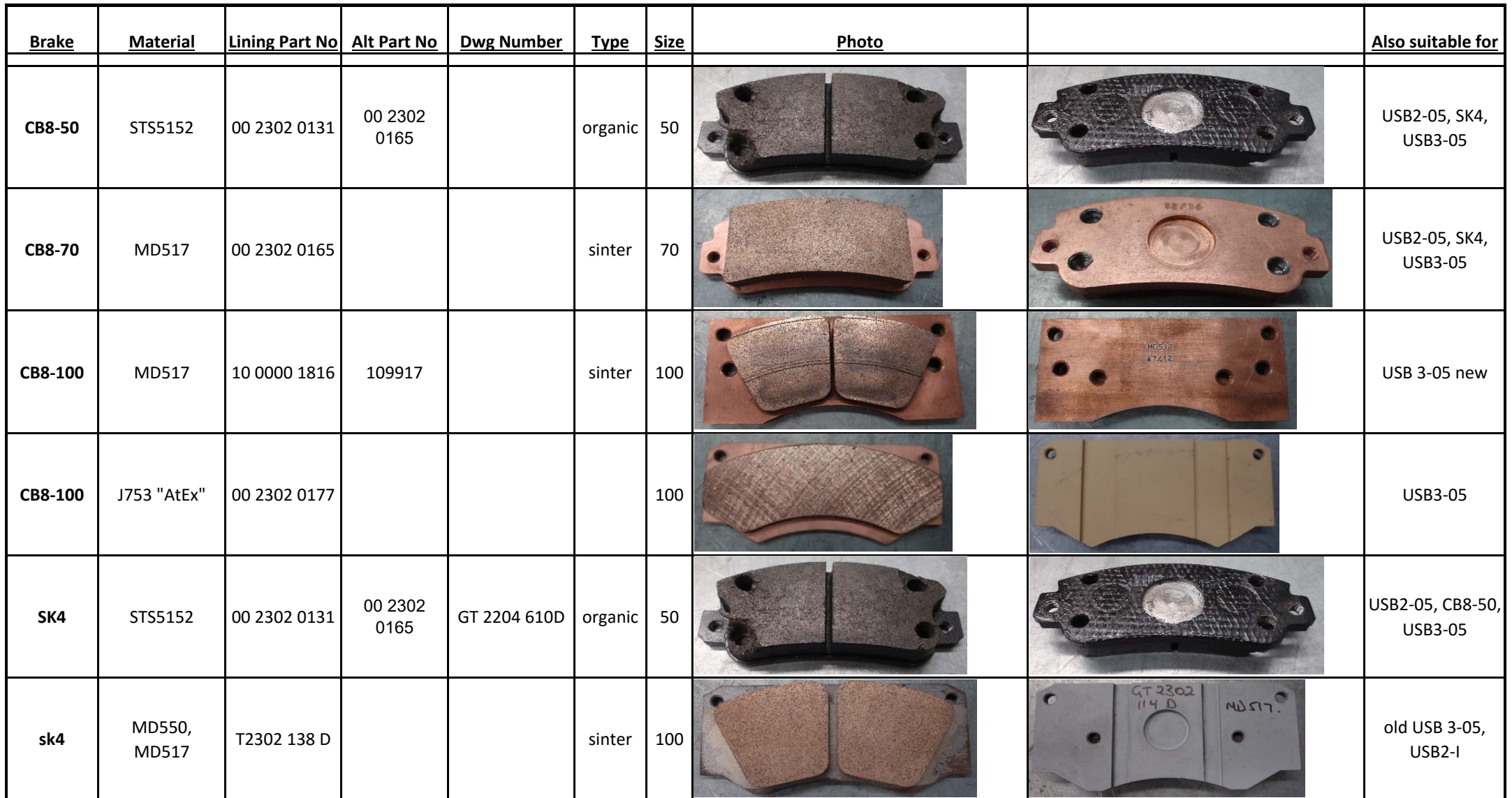
Brake Lining Identification Chart